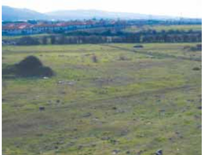
View of Section A showing location of 'marshy' area

The track bed construction of the proposed Luas Line A1 will generally involve the excavation of a trench that will vary in width from 6.0–9.0 metres and will be excavated to a maximum depth of 1.2 metres. The working width of the corridor observed by the contractor is approximately 20 – 30 metres. The bulk of the route of the proposed development will pass through green field areas and existing road surfaces, as well as watercourses and drainage ditches within the Camac River catchment. Although these areas show signs of modern disturbance there is a potential that previously unrecorded subsurface archaeological soils, features or deposits will be uncovered during ground breaking and earthmoving activity.