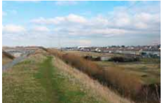
View of Section A from West

Another watercourse which feeds the River Camac is located in Section C; this is visible as an overgrown ditch and bank, the dimensions of which could not be ascertained. Section C is predominately rough pasture with the exception of a number of structures, noted below, and an area of hardcore at the Saggart terminus of the proposed route.