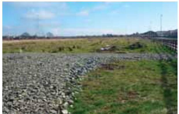
Fortunestown Lane (Section C) from West