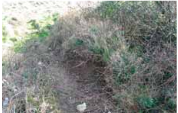
Watercourse to West of N82