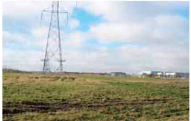
View of Section B from East